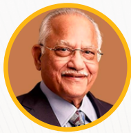
CHIEF PATRON DR. PRATHAP C. REDDY