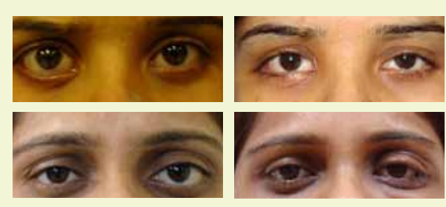
Surgical reshaping of eyelids - Eyelid contouring