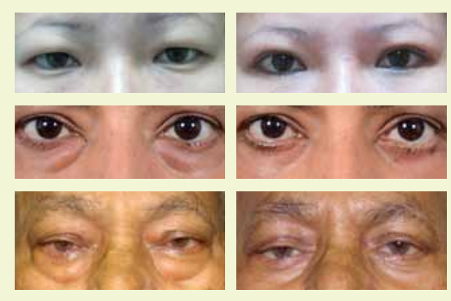
Correction of extra fold of skin and bags - Blepharoplasty