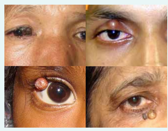
Evelid mass, tumors