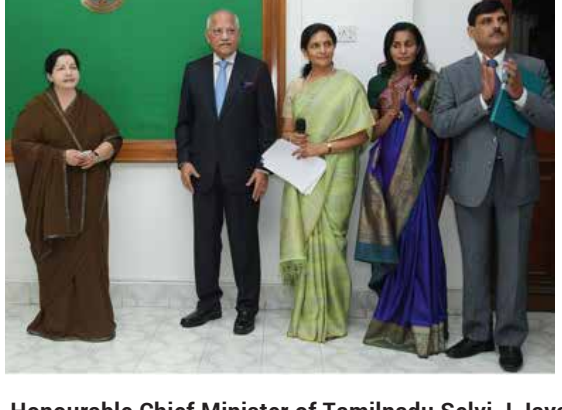
Honourable Chief Minister of Tamilnadu Selvi J Jayalalithaa recognises the 12th Super specialty Hospital of Apollo Hospitals in the State at Vanagaram, Chennai

Apollo Specialty Hospital to be launched at Nellore