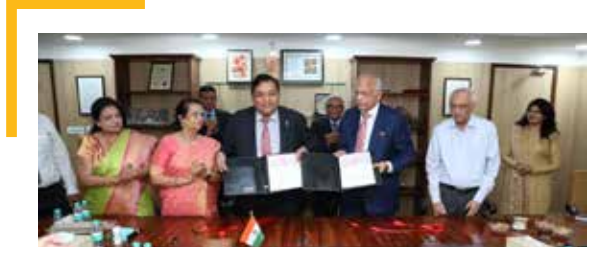
Apollo Hospitals Group has signed an agreement with NMMT for the operation and management of first multispecialty hospital in Navsari, Gujarat

Apollo Hospitals, Chennai has successfully performed India's first minimally invasive Robotic Hybrid Revascularisation surgery on a 63-year-old female patient