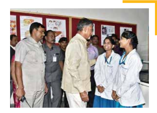
Andhra Pradesh CM inaugurates first phase of Apollo Knowledge City

Apollo Hospitals becomes the first hospital in India to perform 50 Knee Replacement Surgeries (44 unilateral & 3 Bilateral) in a remote village, Aragonda.