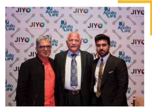
Apollo Life joins hands with Deepak Chopra to launch Apollo JIYO

Apollo Hospitals, Chennai harvested 23 valuable organs from 5 brain dead donors, and performed 5 liver transplants, 1 heart transplant and 4 kidney transplants at our own hospital, and transported 1 heart, 6 cornea and 6 kidneys safely to other hospitals in a 36-hour team effort