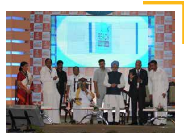
Apollo Reach Hospitals launched by Prime Minister of India.